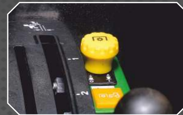
Electrically operated front PTO with safety interlock - Ease of operation and safety