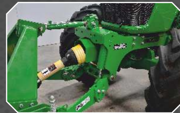
Lift Capacity 1800 Kg - To lift heavy implement