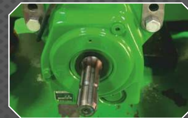
Wet clutch operated front PTO - More Life