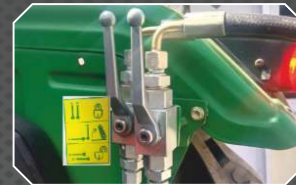
Front Hitch ON/OFF valve - Ensures safety during transportation