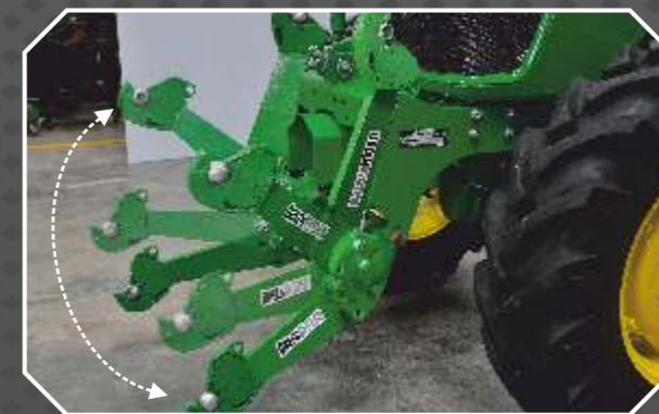
Foldable lower links