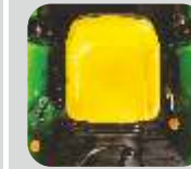
Side shift control levers