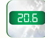
Digital Hour Meter