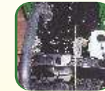
Radiator with Overflow Reservoir