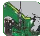
International Looks (Automatic hood with lock)