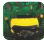
Side Shift Gears