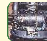
Dry Type Air Filter