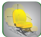
Smart 3D Seat