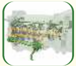
Top Shaft Lubrication