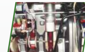
Oil Jet for Piston Cooling