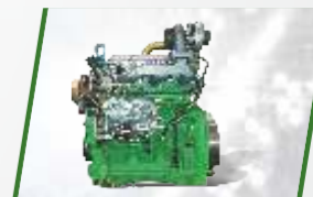
John Deere 3029H engine Powerful and fuel efficient