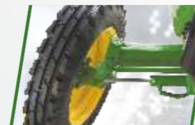
Power Steering with Tilt Steering Work hard. Drive smooth.