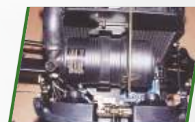
Dry type air filter 99.9% clean air ensures longer engine life