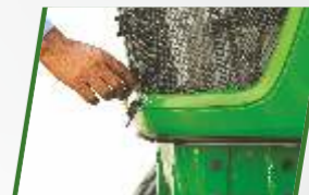
Hood Lock Totally secure