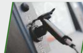
Mobile Charging Point with Holder Stay connected anytime