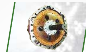
Power Brakes Self adjusting, self equalising, hydraulically actuated, Oil immersed disc brakes