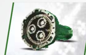
Planetary Gear with Straight Axle Low noise, less vibration, highly durable