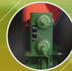
Factory Fitted 2 nd SCV (Dual SCV)