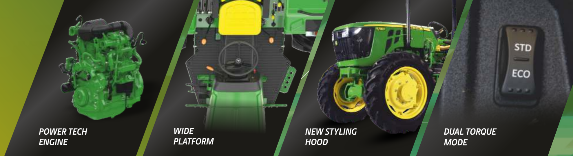
POWER TECH ENGINE

Usher in a new reign of prosperity with PowerTech 5310 GearPro.