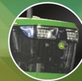
LED Headlamp with Wrap Around Chrome Bezel