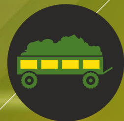
HIGH BACK-UP TORQUE