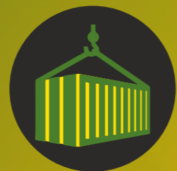
INCREASED LIFT CAPACITY - 2500 KGF