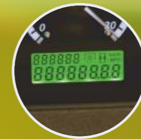
Longer Service Interval (500 hrs.)