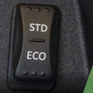
DUAL TORQUE MODE