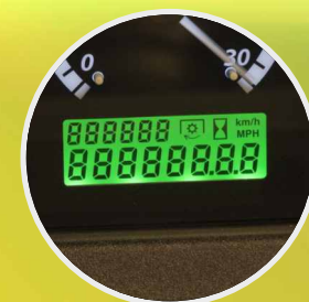
Longer Service Interval (500 hrs.)