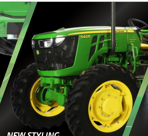
NEW STYLING HOOD