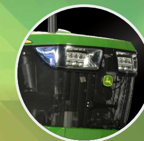
LED Headlamp with Wrap Around Chrome Bezel