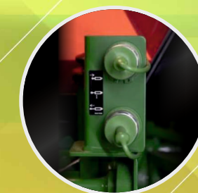
Factory Fitted 2 nd SCV (Dual SCV)