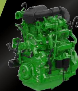
POWER TECH ENGINE