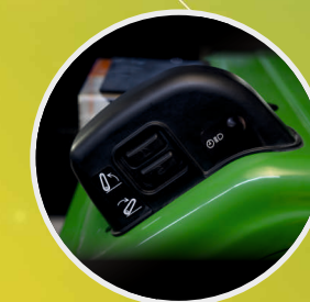
EQRL with Go Home Feature