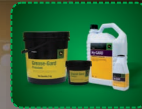
Longer Service Interval (500 hrs.)