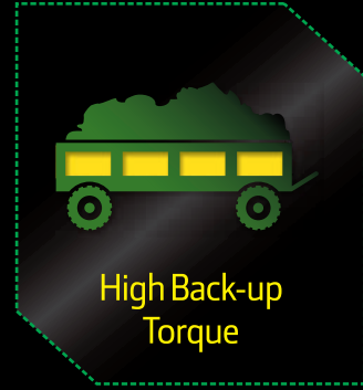
High Back-up Torque