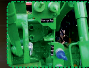
Factory Fitted 2 nd SCV (Dual SCV)