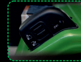
EQRL with Go Home Feature