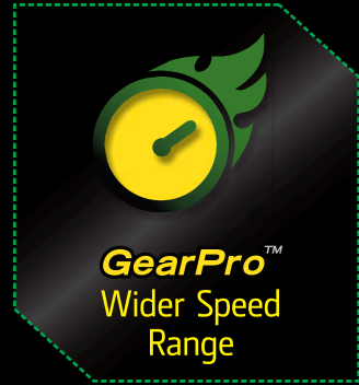
GearPro™ Wider Speed Range