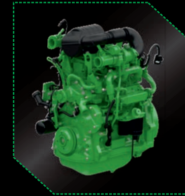
PowerTech™ HPCR ENGINE