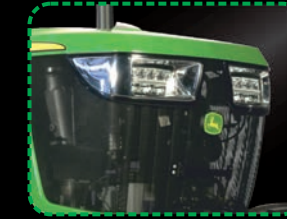
LED Headlamp with Wrap Around Chrome Bezel