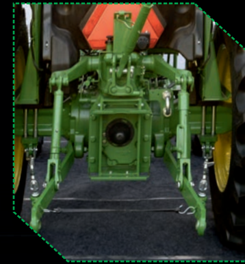
LiftPro™ HIGH LIFT CAPACITY