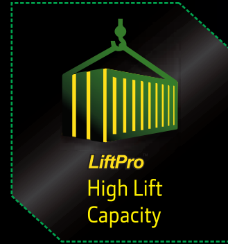
LiftPro High Lift Capacity